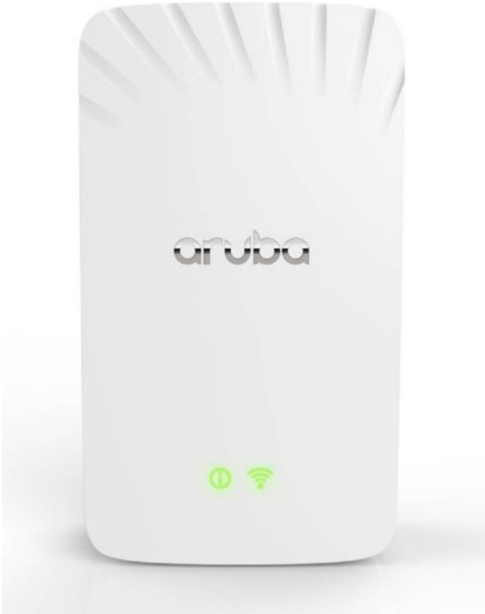
Aruba 500H Series Unified Hospitality Access

These economical Wi-Fi 6 access points provide high-performance connectivity for any organization experiencing growing mobile, cloud and IoT requirements. With a wireless aggregate data rate of up to 1.5 Gbps and gigabit local wired ports, they deliver the range of connectivity options needed for venues such as hotels, residence halls, and remote offices alike.